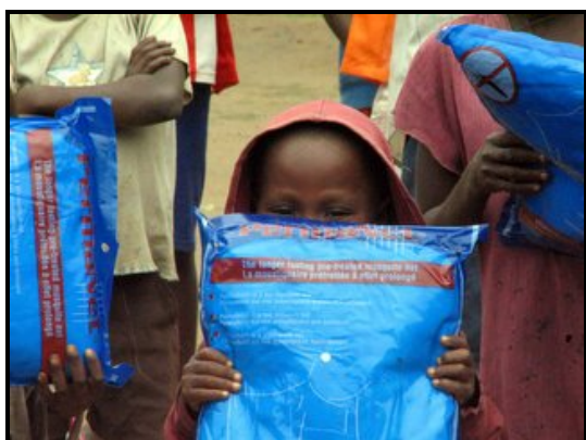
Receiving the insecticide treated nets

IF has received reports, photographs and video clips of the results of the first tranche of funding. Overall, the results are very pleasing.