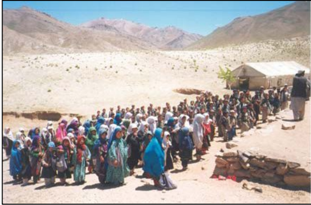
Borjegai school children with a UNICEF-provided tent as a make-shift classroom

With much achieved, and many new and exciting avenues to continue providing assistance, the IF volunteers connected with our Afghanistan project have told us they feel very privileged to be involved. We can only agree!