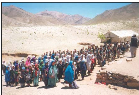
Borjegai school children with a UNICEF-provided tent as a make-shift classroom

With much achieved, and many new and exciting avenues to continue providing assistance, the IF volunteers connected with our Afghanistan project have told us they feel very privileged to be involved. We can only agree!