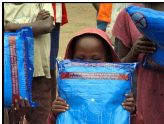
Receiving the insecticide treated nets

IF has received reports, photographs and video clips of the results of the first tranche of funding. Overall, the results are very pleasing.